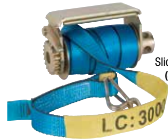
Slide-on Winch (342009-9)

Compatible with Beaver's Reversible Ratchet Winch Bar (342420)