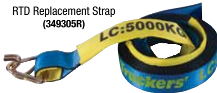
RTD Replacement Strap (349305R)

c/w 2 x wear sleeves & Hook & keeper (unless otherwise stated) Complies to AS/NZS 4380