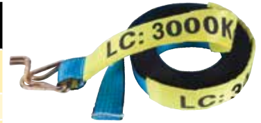
Winch Replacement Strap (342313)