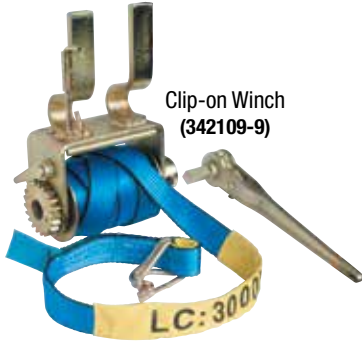
Clip-on Winch (342109-9)